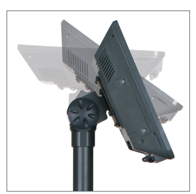
Easily tilt monitor to desired angle