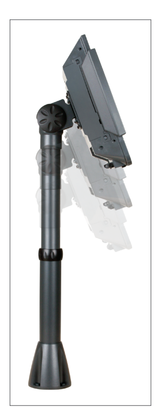
Quickly adjust monitor height