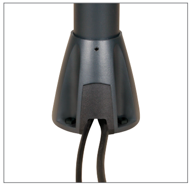
Cables may exit above or below counter