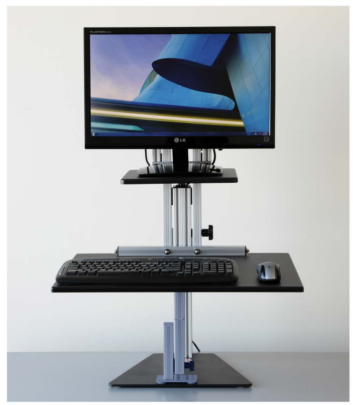
optimal location for support leg

How to Adjust Your Junior to Support Laptop or Monitor